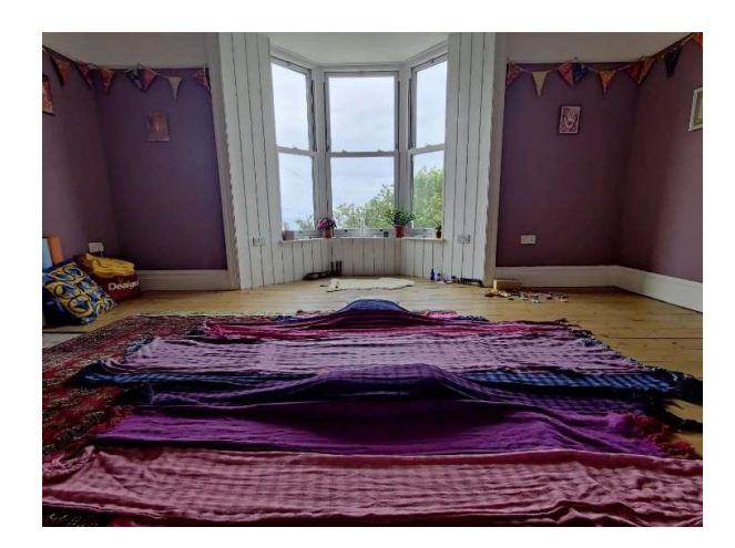
The training space in Portland with sea views

We are offering this training as an extended weekend-training with 40 hours of teaching, ceremony, and supervised practice time, + Gong Bath + Yoga & Meditation session all spent in deeply nurturing sisterhood and being cared for by myself and our host & cook Puran Arianna — with the option of on-site full-board accommodation! These hours will be spread out over 7 days (we start Monday afternoon, and finish Sunday after lunch), a mixture of full training days and half-days, so you also have time on the gorgeous island for yourself and your own processes, and/or to spend in relaxed sisterhood together. My personal recommendation is to also give yourself some time before and/or after this training to explore this gorgeous island and/or parts of the Jurassic Coast — Portland, Weymouth, the Fleet, Chesil Beach, ... are all stunning at any time of year.