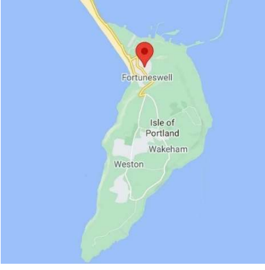
The house is located 10mins walk from beautiful Chesil Cove: