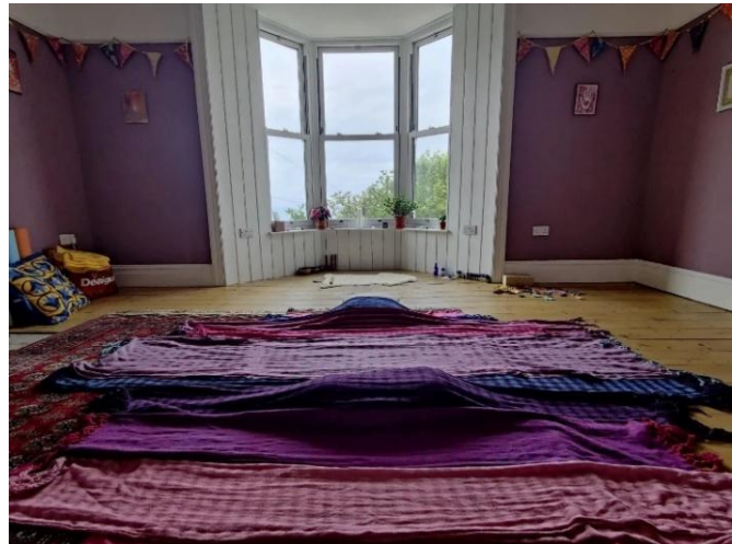
The training space in Portland with sea views

We are offering this training as a 4-day training with 30 hours of teaching, ceremony, and supervised practice time, all spent in deeply nurturing sisterhood and being cared for by myself and our host & cook Arianna – with the option of on-site full-board accommodation!